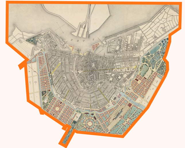
Plan tot uitbreiding van Amsterdam Universiteit van Amsterdam

The ultimate goal of Allmaps is to make all digitized maps accessible and to provide an interface for exploring IIF maps across collections and institutions.