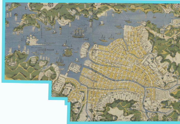
Hizen Nagasaki no zu Ser. 360